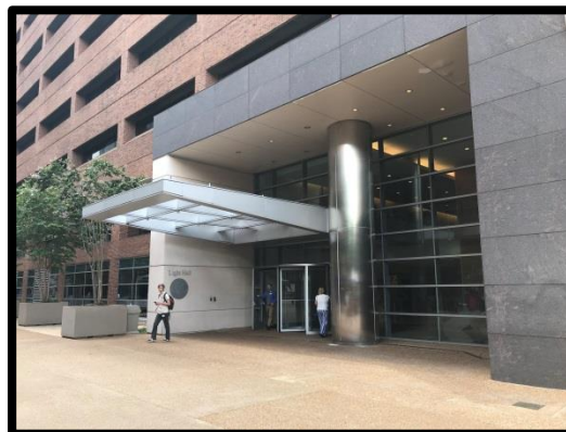
Light Hall Building Entrance

Google Maps: Type in " Light Hall " in the Google Maps search bar to guide you right to the building.