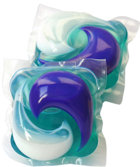
Tide® Laundry Detergent Pods