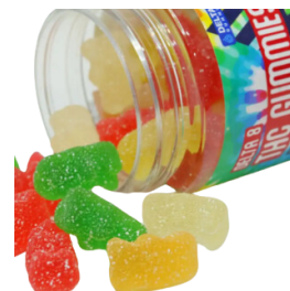
Delta-8 THC Gummies