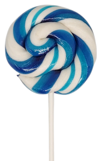
Swirl Lollipop Candy

The convenience of laundry detergent pods has led to unintentional consequences for households nationwide. In fact, from 2014 to 2022, U.S. poison centers reported more than 114,800 calls related to laundry pod exposures. Always store items in their original containers or properly label new containers.